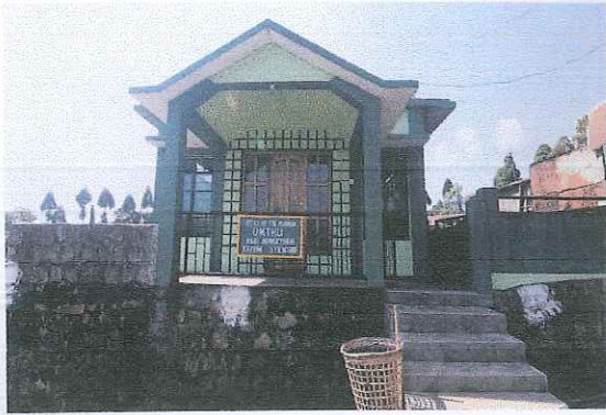
An Office of the Village Durbar

Umthli Village located in Khatarshnong Laitkroh Block in East Khasi Hills District, Meghalaya is a village with about 300 households of tribal population belonging to the Khasi Scheduled Tribe. The main livelihood of the people is farming and vegetation as well as nonfarm activities mainly of construction works.