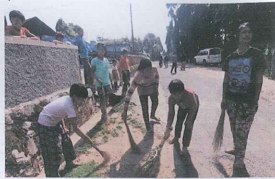
Children merrily cleaning the village

The special attraction is that children in particular are motivated to be alert and whenever they find some litter on the ground, they would pick them up, carry it to their own backyard where they dump them in their compost bins.