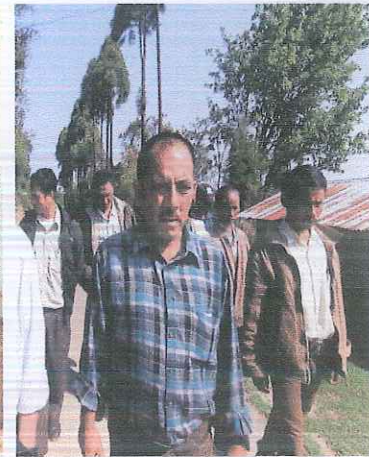
The Village Committee Members and the Village Headman inspecting the cleaning drives

The secret of success lies on the integrity of the Village Durbar under the able leadership of the Village Headman who could command voluntary participation of all.