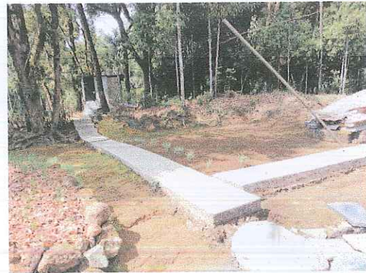
A house backyard

A visit to the village will tell us how alive the village is in keeping itself clean. It is a litter and liquid waste free village. Waste baskets are seen along the roadsides and footpaths. Side drains and storm water drains are well constructed with proper slopes using funds from MNREGA.